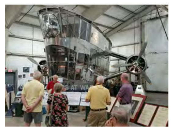
The gondola from a dirigible

Fifteen damp, but vigilant members of our club arrived at the New England Air Museum in Windsor Locks, CT at 10:00 Saturday morning. Drusilla Carter had arranged for a special tour of the museum with the emphasis on Packard. The aircraft items on exhibit include military as well as commercial examples. We spent 2 ½ hours touring the hangers and saw pioneer "aeroplanes", helicopters, dirigibles, prop planes and jets. Our tour guide was most knowledgeable and entertaining, and I for one, discovered that there are a number of our members who know their automobiles and also know their aircraft!