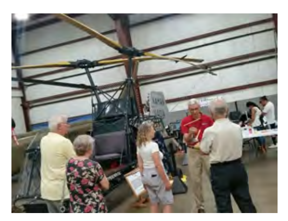
A prototype double-shaft helicopter

The museum has a number of Packard Aviation engines; from an engine used in the US Navy dirigible The Shenandoah in 1922 to the famous Merlin engine of WWII fame.