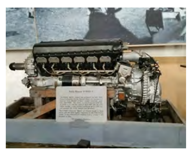
The Merlin Packard Engine

The museum has a number of Packard Aviation engines; from an engine used in the US Navy dirigible The Shenandoah in 1922 to the famous Merlin engine of WWII fame.