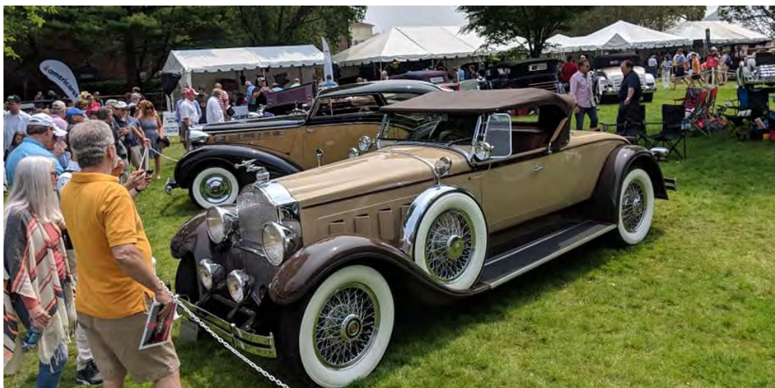
Scenes from the Greenwich Concourse