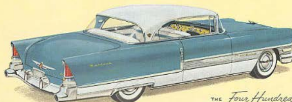
THE Four Hundred 30 HORSHPW SPRINTED AND ELEGANT HARBOR

Packard models... the exciting Caribbean... the magnificent Patrician... the sophisticated Four Hundred. These newest of all the fine cars are distinctive not only in appearance but in every respect. For example, Packard's new V-8 is the most powerful American passenger car engine, for it delivers the greatest driving